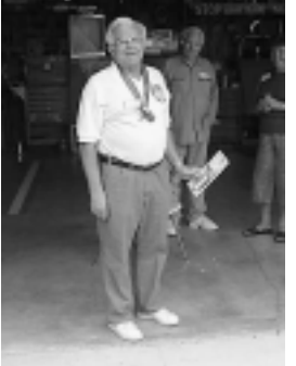
Fan Belt Toss Winner