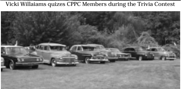
CPPC Members cars, always a good turn out at club events.