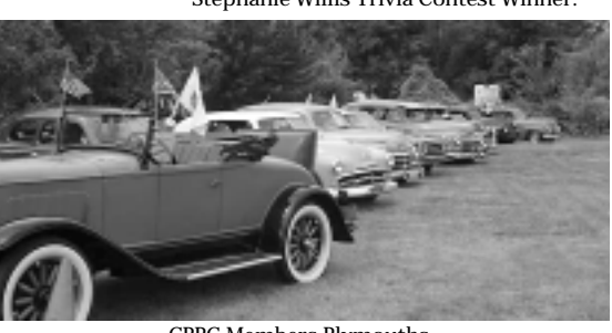
CPPC Members Plymouths